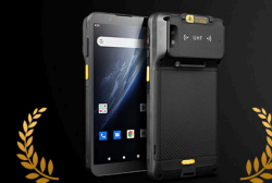
MC51 Built-in RFID Reader

RFID LIVE! FINALIST FOR BEST NEW PRODUCT @ RFID JOURNAL